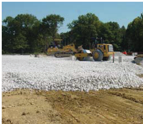
Figure 2. No. 2 subbase stone is spread and eventually compacted over a non-compacted soil subgrade for this large PICP parking lot in Illinois.

Moreover, the pavement should not receive runoff until the entire contributing drainage area is stabilized with vegetation. Obviously, vegetation doesn't grow overnight and rain will likely fall right after the pavement is installed. Therefore, erosion control matting can stabilize soil while grass or other vegetation starts to grow. This should be included in the con-