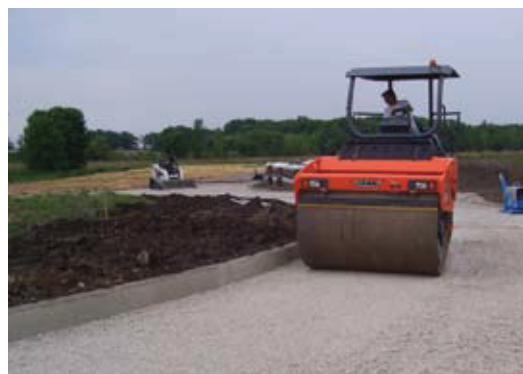
Figure 5. A dual drum roller compacts the open-graded base first in vibratory then in static mode. This particular machine is a 12-ton roller.

Figure 5 shows a dual drum roller compacting the open graded aggregate. The No. 57 base layer can be spread and compacted as one 4 in. (100 mm) lift. Figure 5 shows the No. 57 aggregate spread over the No. 2 stone and being compacted with a heavy plate compactor. This equipment is also effective in compacting No. 57 stone. Compacting will