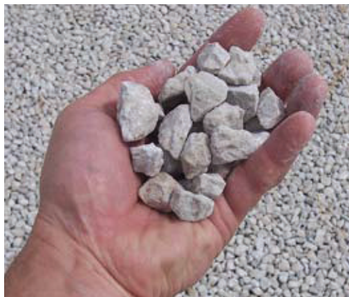
Figure 3. Smaller than No. 2 stone, No. 57 aggregate provides a base to receive the bedding material and pavers.