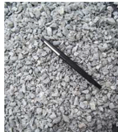
Figure 4. No. 8 bedding material and joint material. Finer gradations may be used such as No. 89, 9 or 10. Sand is never used.