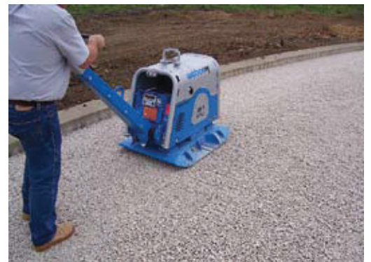
Figure 6. A 13,500 (60 kN) reversible plate compactor is also effective in compacting No. 57 stone.