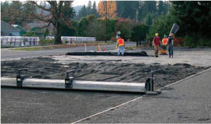
Figure 7. Mechanical screeding of the bedding material speeds construction on larger projects.

be made a bit easier when all stone surfaces are moist. This enables the particles to slide and move into their tightest fitting figuration more easily.